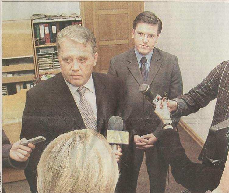
Окончание на стр. 2 Судьбу министра внутренних дел Марека Сеглиньша премьер-министр Андрис Берзиньш решил за несколько часов.

В ходе расследования "дела Народной партии " полицейские из ББОПК вышли на типографию, которая находится в Риге на ул. Бривибас. В ней и печаталась подозрительная агитация. Вчера стражи порядка устроили ловушку — проследили, куда от ул. Бривибас поедет легковая машина Ford Escort , груженная листовками.